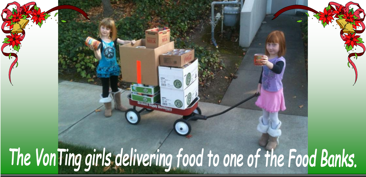
The VonTing girls delivering food to one of the Food Banks.